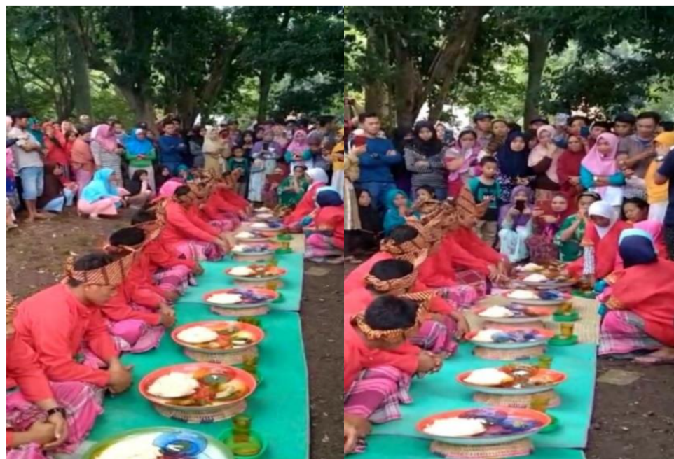
Figure 2. Pangadakkang

In addition to carrying out the traditions of Assongka Bala, traditionally the community protects themselves from the disgraceful actions regulated by adat in rituals. Pangadakkang (adat) applies when the community violates or commits a despicable act. This can cause diseases that cannot be detected by modern medical science. Society recognizes it as a special disease because of mistakes. It is said that the disease can be treated but cannot be cured and is very susceptible to an unnatural death. These diseases such as leprosy which are hereditary up to two times seven generations, the body is swollen and blackened, broken bones, accidents, and when he died his body suddenly decayed and blackened, Pangadakkang form as follows: