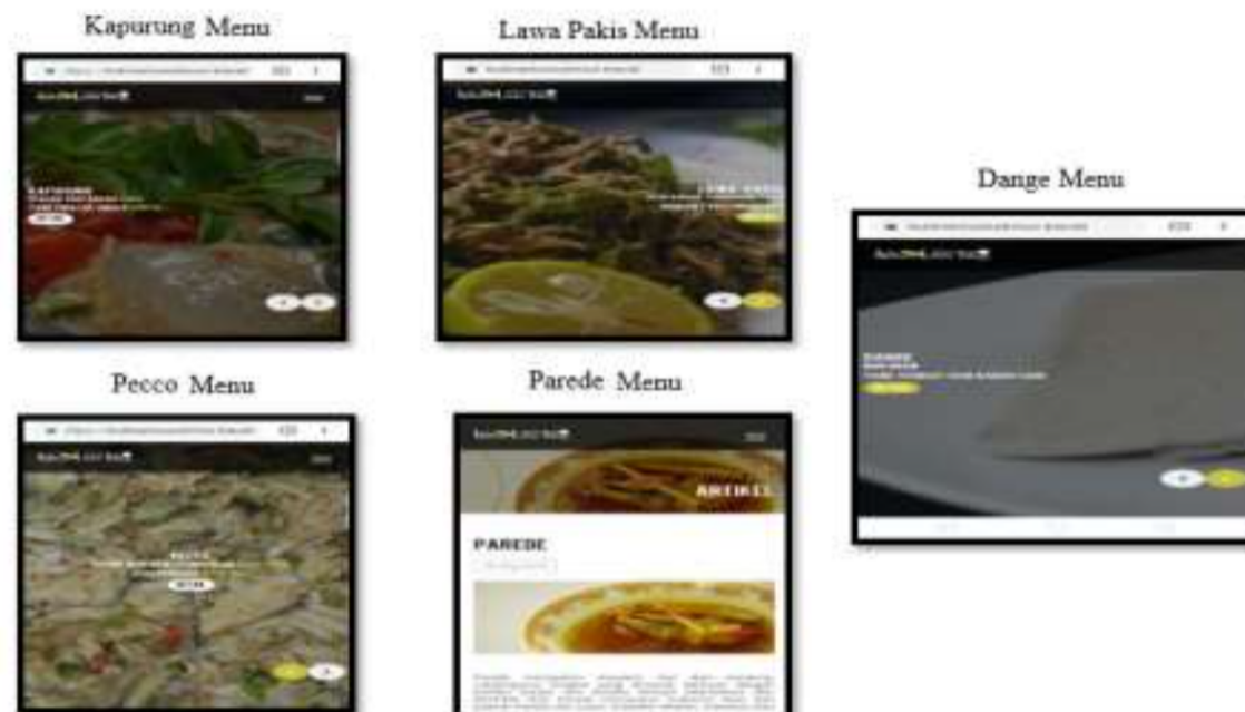
Figure 2. Display menus on the Website

The GIS application user interface for culinary attractions in East Luwu Regency is divided into 2 parts, namely the web system user interface and the Website application user interface. The interface or better known as the user interface is a medium that connects humans and computers to interact with each other. Before designing the interface of all forms on the Website, then to make it easier to design will be explained in advance the menu structure or site map of the system.