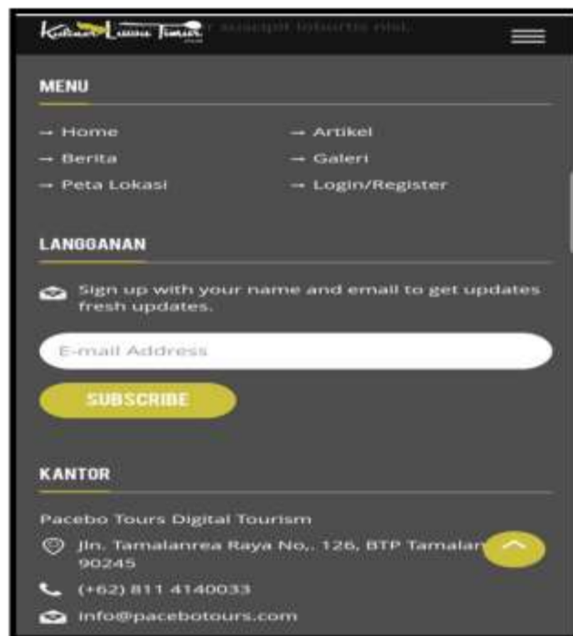
Figure 3. Account settings on the website

Based on interviews it was confirmed that the types of dange found in East Luwu Regency were different from those in Pangkep Regency. This difference can be seen in the use of raw materials for sago and glutinous rice. This difference in raw material also certainly affects the taste. Dange in East Luwu Regency is thinner and elongated when it is served with Parede, Kapurung, and Lawa Pakis.