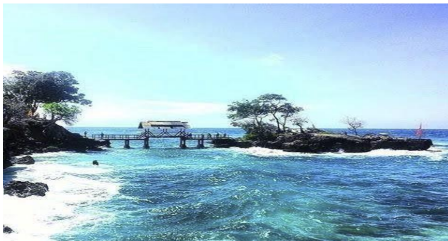
Figure 2. Picture The condition of Samboang Beach