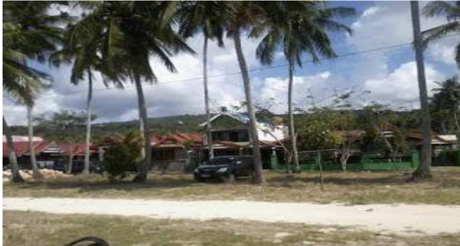
Figure 5. Picture One of the behavior of the community and visitors