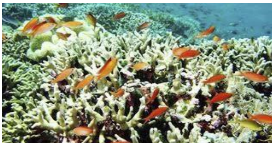
Figure 3. Picture The condition of Samboang Beach

The results of observations obtained by researchers related to coral reefs, researchers can see that the condition of coral reefs located under the sea of Samboang beach is still good and there has not been significant damage so that it can be described and concluded the tourist activities that can be done namely snorkeling by tourist According to one informant source Mr. Suhardiman Syam who has felt the beauty of the underwater and coral reefs of the Samboang beach, he informed researchers that the beauty of the coral reefs on the Samboang beach can be said to be mostly still beautiful, and there hasn't been much damage so that it can be used as one of the advantages of the Samboang beach, but when researchers conducted observations at the DTW the authors get coral debris or coral found on the shoreline generated by the fish bombing by a small number of people who are looking for life on the Samboang Beach, things This is a challenge for the local government and stakeholders in the area to provide an understanding of the importance of coral reef conservation, which leads to an improvement in the economy of the local community.