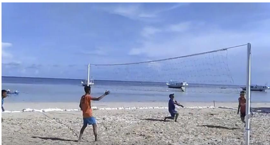
Figure 4. Picture One of the Activities at Samboang Beach

In addition to the activities mentioned earlier, other activities that can be carried out by tourists besides fishing according to the writer's observations are beach sports (volleyball), sunbathing, playing sand, relaxing on white sand and resting in the space provided in the form of gazebos that located on the Samboang beach. Besides that, at a certain time, the event was held, namely the Dato Tiro cultural festival. Besides that, in Samboang Beach there is a rock which is about 20 meters from the shoreline that can be visited by tourists on foot through facilities such as a bridge to get to the place.