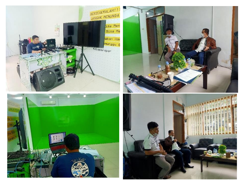
Picture 3. Podcast through social media as an effort by the Pare-Pare Tourism office to help the community and MSMEs market culinary products