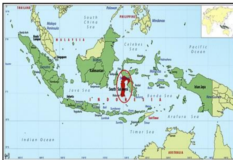
Figure 1. Map of Jeneponto regency of South Sulawesi province of Indonesia

Jeneponto regency is well recognised with its “horse” ( kuda in Bahasa Indonesia and Jarang in the local language), a brand that brings Jeneponto as the center of horses (Wangsyah, 2016). Horse meat is mostly consumed by Jeneponto people. Thus, it is not surprising that coto kuda