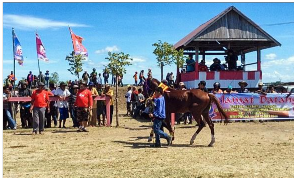
Figure 2. The A'jarang festival in Jeneponto regency