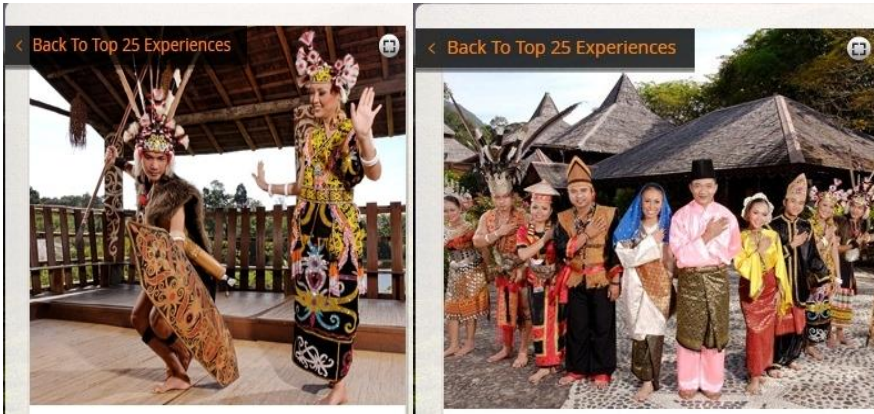
Figure 2 The Malaysian cultures

ethnic in Malaysia and the diverse traditional costumes belonging to different ethnic groups warmly welcoming the potential tourists to Malaysia.