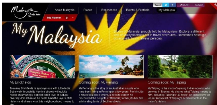
Figure 3 The subpage of official tourism website of Malaysia

Similar to the linguistic resources, the subpage of the tourism website of Malaysia reveals the truth of images used in portraying diversity of the destinations (Jewitt, 2009; Lirola, 2006). In this subpage, the three photos which are lined up across the centre of the page, stand out. The prominent appeal of these three images foreground the portrayal of the diversity of destinations in Malaysia (refer to Figure 3), from the historic city of Melaka on the left, the sandy beaches in Penang to the lush greenery of Taiping.