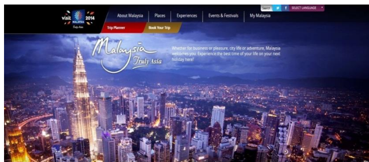
Figure 6 Homepage of official tourism website on Malaysia (Source : http://www.tourism.gov.my/intl_en/home retrieved on September 22, 2012)

sophisticated photo of the tower among the buildings is in fact the truest visual representation of the reality of the uniqueness and diversity of Malaysia (see Figure 6). The use of full colour saturation, bright colour tone and great pictorial detail are the main indicators ( Kress & Van Leeuwen, 2006)