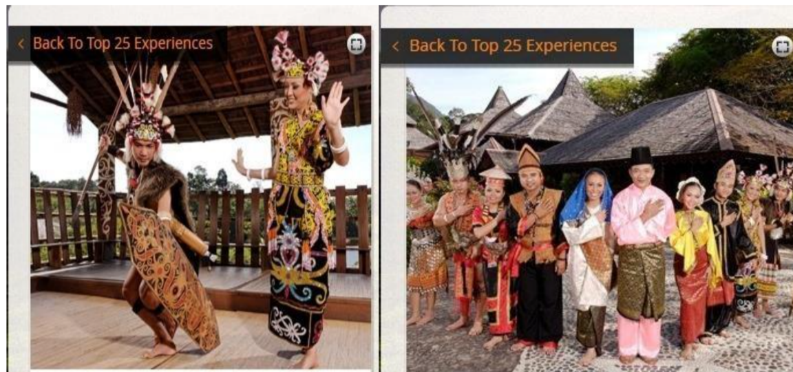
Figure 2 The Malaysian cultures 21

ethnic in Malaysia and the diverse traditional costumes belonging to different ethnic groups warmly welcoming the potential tourists to Malaysia.