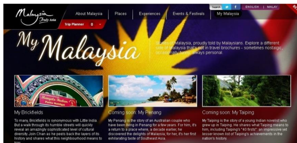
Figure 3 The subpage of official tourism website of Malaysia 8

Similar to the linguistic resources, the subpage of the tourism website of Malaysia reveals the truth of images used in portraying diversity of the destinations (Jewitt, 2009; Lirola, 2006). In this subpage, the three photos which are lined up across the centre of the page, stand out. The prominent appeal of these three images foreground the portrayal of the diversity of destinations in Malaysia (refer to Figure 3), from the historic city of Melaka on the left, the sandy beaches in Penang to the lush greenery of Taiping.