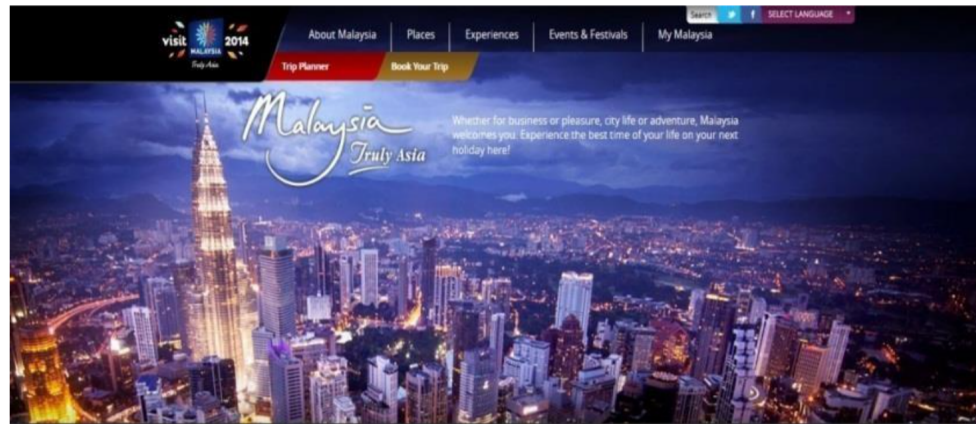
Figure 6 Homepage of official tourism website on Malaysia

sophisticated photo of the tower among the buildings is in fact the truest visual representation of the reality of the uniqueness and diversity of Malaysia (see Figure 6). The use of full colour saturation, bright colour tone and great pictorial detail are the main indicators ( Kress & Van Leeuwen, 2006)